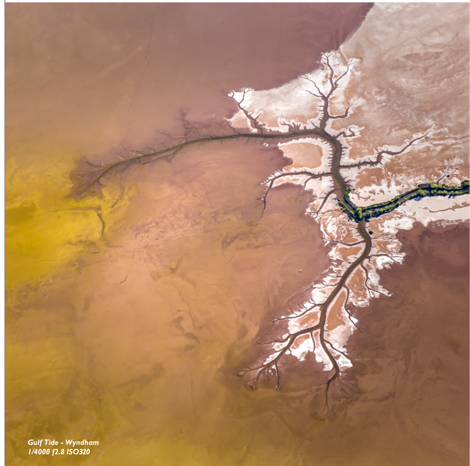
Gulf Tide - Wyndham 1/4000 f2.8 ISO320

If someone asked me what my favourite style of photography is, I'd have to say abstract aerals. The Kimberley is becoming quite well know for producing some excellent aerial photo locations and I have been lucky enough to fly over many of them, some several times. This has allowed me to build up a strong portfolio of Kimberley aerial images resulting in a couple of Gold in the International Pano Awards. Most of these have been taken from a helicopter, my favourite form of transport! But I have also used light aircraft and a drone.