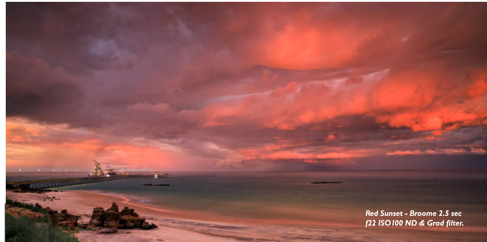
Red Sunset - Broome 2.5 sec f22 ISO 100 ND & Grad filter.

I'm stepping it up a notch this year and in June I will be running a six day Astro Photography tour. Getting out at night shooting takes top priority. There will be tips on astro technique and time for post processing. We head out of Broome for a couple of days to capture one of my personal favourites, boab trees, under the night sky. I've also added in coastal locations to capture the colours and textures of the nine metre tides occurring during that period. Another photographic journey I'm embarking on is creative photography. This year I have teamed up with the wonderful Sandra Dann who has won various awards for her creative style photography including a 2019 Gold Award Creative Category - Better Photography.