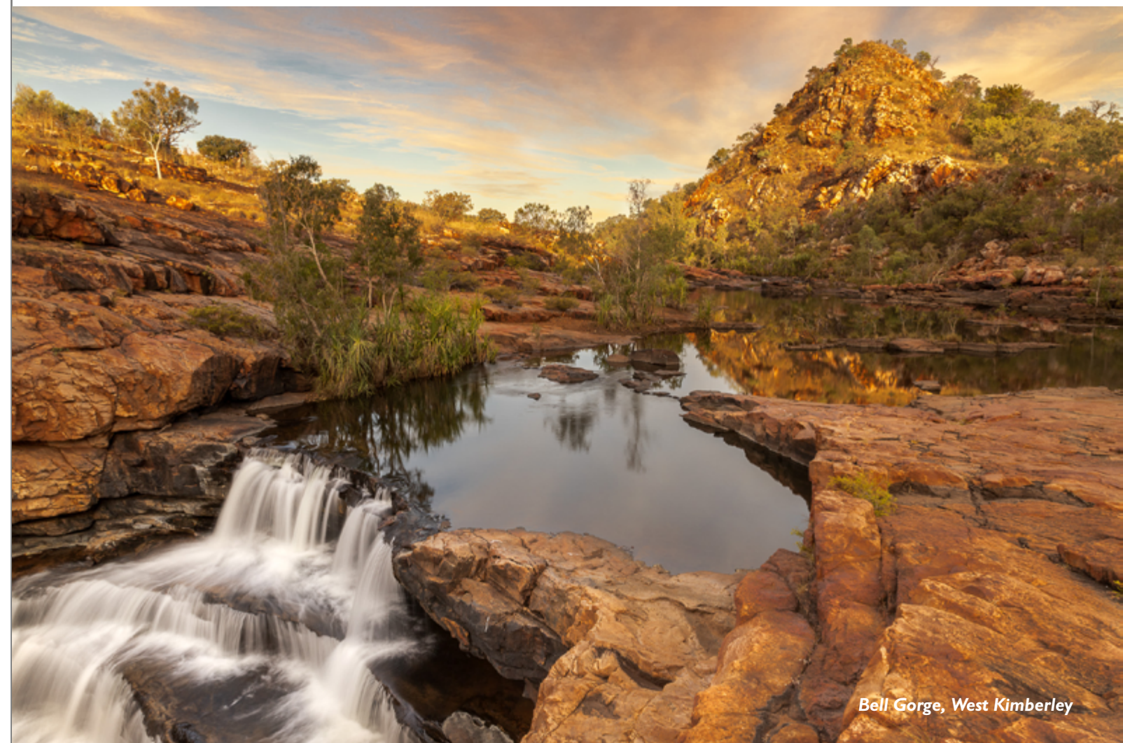
Bell Gorge, West Kimberley